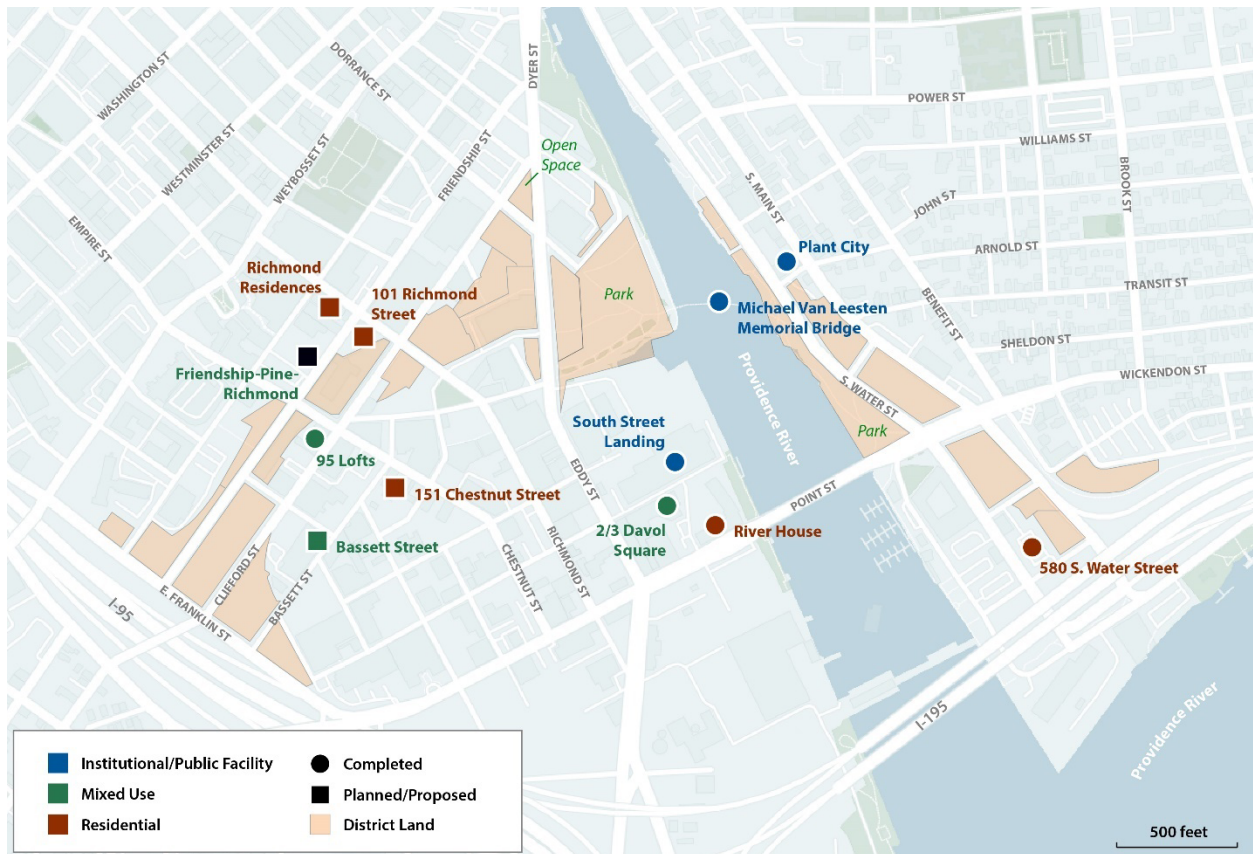
Figure 2: Map of recently completed or proposed projects adjoining or near the Providence Innovation and Design District